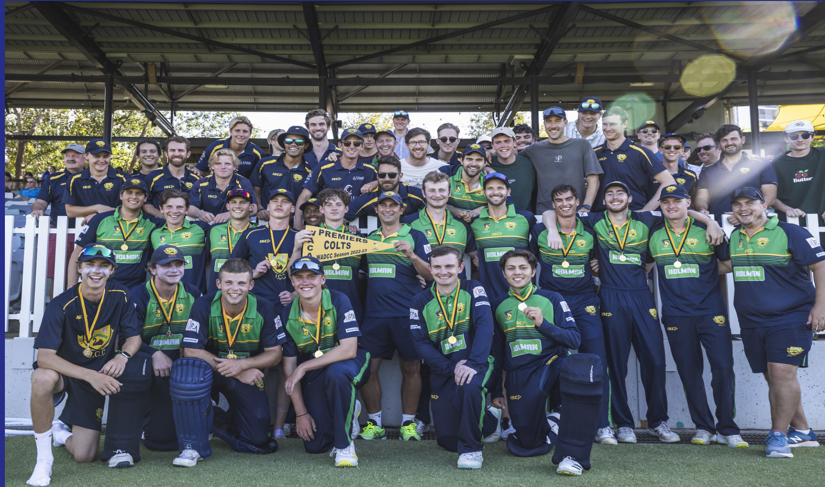
Pictured: Club Celebrating the 2022-23 Colts Premiership at the WACA