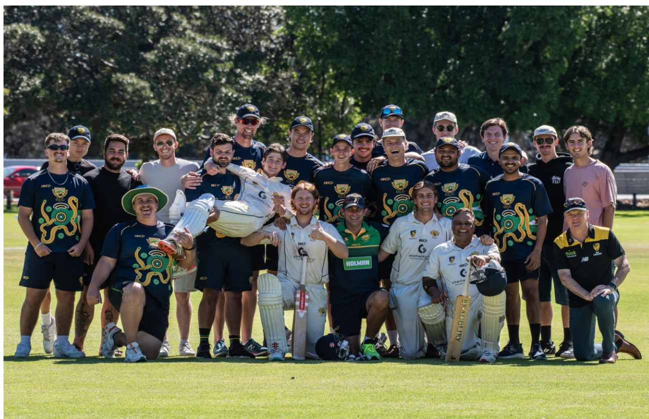
UCC 4th Grade – WA Premier Cricket 4th Grade 2023-24 Premiers